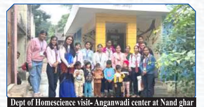
Dept of Homescience visit- Anganwadi center at Nand ghar