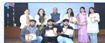
Department of Commerce Organised COMMBATT