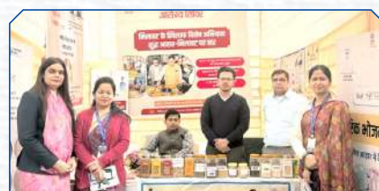
Red Ribbon Club participated in Sarkaar Arogya Shivir