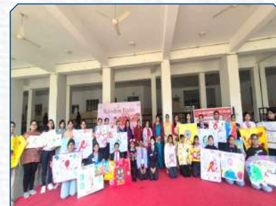
World AIDS Day Celebration-RRC