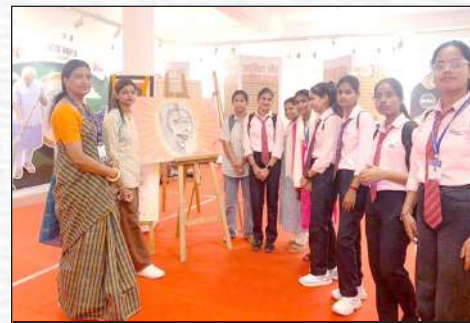
Dept of Drawing participated in 16th International Rangmalhar- Art camp