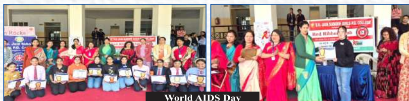
World AIDS Day