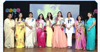
Freshers' party - Aagaaz 2025