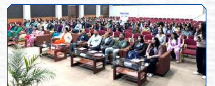
Bajaj Finserv training- valedictory ceremony event