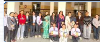
Photography club organised portfolio competition