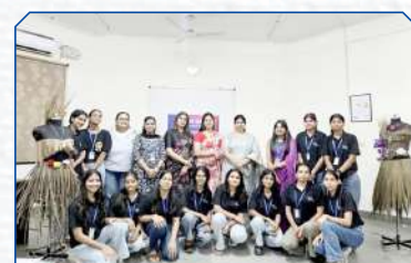
10 days Training prog Wood and its Market product design