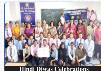
Hindi Diwas Celebrations

On 13 th September on the eve of Hindi Diwas, an essay competition (topic of "Use of Hindi in the Current Context" and Poetry Recitation were organized under the joint auspices of the Hindi Literature Department, Arts Club, National Service Scheme, and Rangers Club.