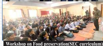
Workshop on Food preservation(SEC curriculum)