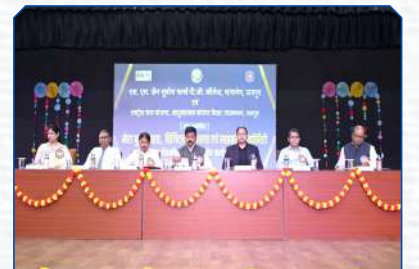
One day Divisional-level workshop -NSS