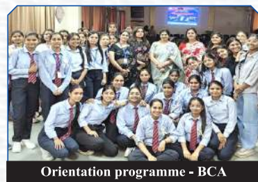
Orientation programme - BCA