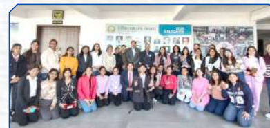
Bajaj Finserv Certified Program in Banking