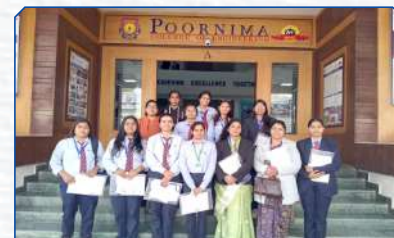
Maths dept students participated in Mathematical biology & ecology for sustainable development