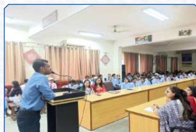
Youth connect Training Programme-NSS