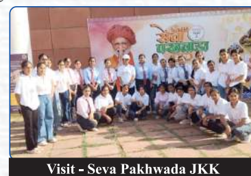
Visit - Seva Pakhwada JKK

On 25 th September, the Drawing & Painting Department and the Art and Craft Club students visited the Jawahar Kala Kendra, to observe the "Seva Pakhwada 2025", the Namu Exhibition, and live painting by artists. The students gathered prolific information from the artists about the basics of their art techniques and mediums.