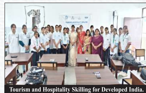
Tourism and Hospitality Skilling for Developed India.