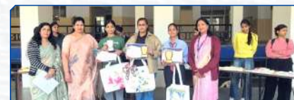
Art and craft club Organized Tote Bag painting