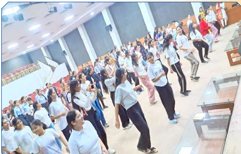
Commers club organized Fitness session