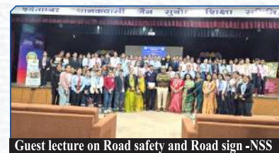
Guest lecture on Road safety and Road sign -NSS