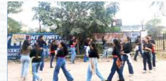
CWC club organized Nukkad natak