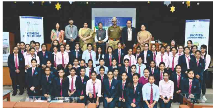
Marico Centre for Women Empowerment

On 13 th November, 2021, “Bloomies Spark- 2021”, an event for the budding managers of BBA was organised, which aimed to bring young and keen minds together in order to generate a sense of professionalism among students.