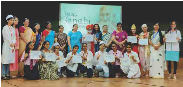
Gandhi Jayanti Celebration

On 17 th August, 2021, GATEWAY TO SUBODH- “Online Admission cum Scholarship Test” was organised for the students of class 12 th from various schools outside and around the city, seeking admission into colleges. The test was in the form of Quiz and Poster Competition in which the winners were awarded.