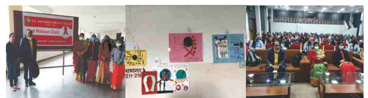
Red Ribbon Club