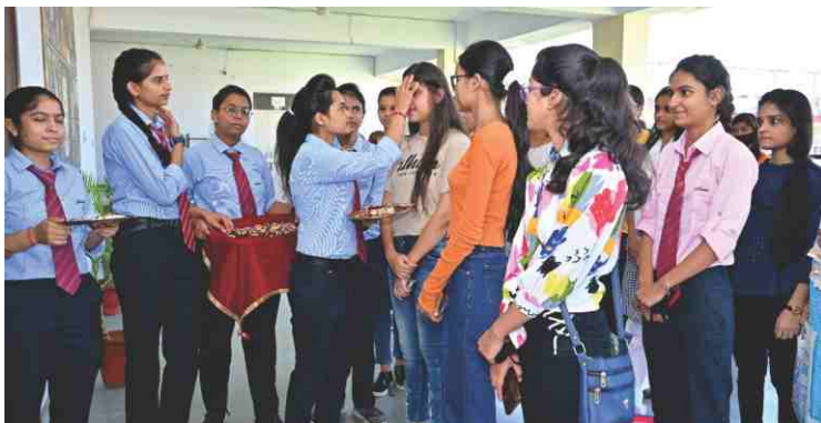
Student Orientation Program

On 4 th October, 2021, “Student Orientation Program” was organised in order to create a friendly and interactive environment for the newcomers.